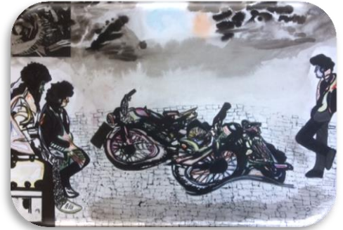
By Archie Armstrong