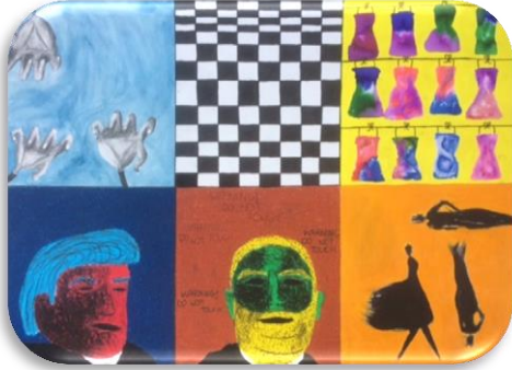
Above and below